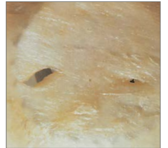
With the Tuohy cannula, the exertion of pressure and the application of tension to the tissue of the dura will inflict a large incised lesion, as may be seen, whereas the SPROTTE® SPEZIAL cannula merely causes a minimal defect. Here the dura largely seals up the catheter ingress.