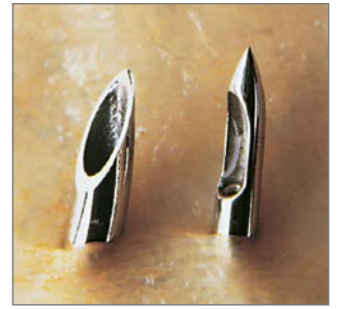
A SPROTTE® SPECIAL cannula and a Tuohy cannula have penetrated the multi-layered texture of the spinal dura.