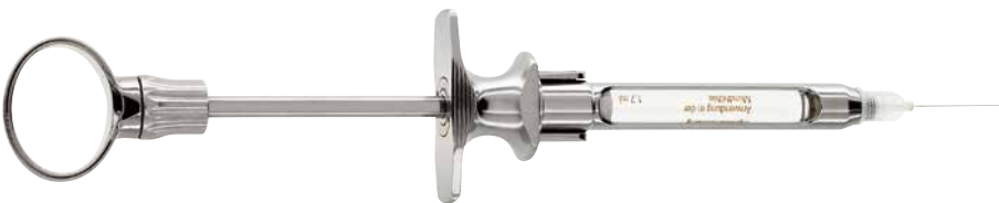
Folding technology – insertion of the cartridge

In contrast to the slip-on device, the folding technology permits the cartridge holder to be swung sideways, and only the cartridge itself is replaced. Alternatively to the folding mechanism with rotatable finger rest, a compact variant with rigid finger rest.