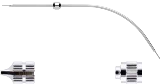
With round groove, chromium-plated, slitted