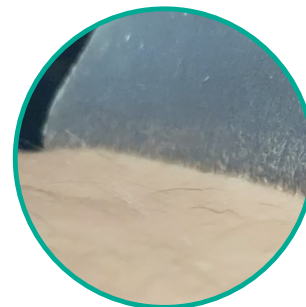
Silicone Adhesive iPRO